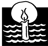
Sábado de Gloria