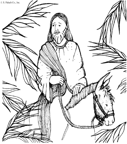
Blessed is he who comes in the name of the Lord.

Our Lenten journey of conversion has brought us to the holiest week of the Church year. With palm branches in hand we enter the holy city of Jerusalem, proclaiming, "Blessed is he who comes in the name of the Lord." From this grand entrance into the city, we follow the Lord Jesus as he shares his last meal with his disciples, institutes the Eucharist, is arrested, betrayed, and killed. Each year this celebration of Palm Sunday of the Lord's Passion plunges us into the saving mystery of Christ's death and resurrection. The Lord's forgiveness of the repentant thief reminds us that reconciliation awaits those who put their faith in Christ. Let the repentant thief's words become our own this day: "Jesus, remember me when you come into your kingdom" (Luke 23:42).