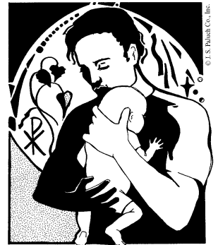
Happy Father's Day

Independence Day / Día de la Independencia