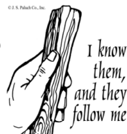
I know them, and they follow me