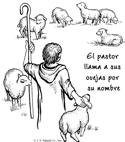
El pastor llama a sus ovejas por su nombre

Hoy escuchamos cómo los judíos de Antioquía rechazaron la prédica de Pablo y Bernabé, quienes se fueron a llevar su mensaje a otros lugares. Después de su experiencia con Jesús resucitado, los apóstoles se sintieron obligados a llevar la Buena Nueva de su Maestro tan lejos como les fuera posible. El intenso amor que sentían por el Señor y el deseo de hacer la voluntad de Dios hicieron que viajaran hasta las tierras del Mediterráneo. Burlas, azotes, encarcelamientos y naufragios fueron parte de esos viajes. Algunos de los apóstoles, incluso Pedro y Pablo, fueron martirizados. Podríamos decir: “Eso fue entonces, pero hoy es otra cosa. Nunca moriré mártirizado”. Puede que no, pero el martirio no se trata necesariamente de una muerte física; la palabra significa “dar testimonio”. Piensa en el anciano que cuida a su esposa con Alzheimer, los padres de un niño autista, la madre soltera cuyo hijo está discapacitado. Todas estas personas dan testimonio del valor que tiene poner el bienestar de otros por encima del propio bienestar, pues diariamente entrega su vida por otra persona. Esta clase de martirio es la fibra que debe predominar en la vida de cada uno de nosotros. Es decisión nuestra que toda gentileza, toda palabra bondadosa, toda atención para con los demás reflejen el amor de Dios para todos. Dios no exige eso de nosotros, pero nosotros podemos exigirnoslo. Demos de corazón y desinteresadamente de todo lo que Dios primero nos ha dado.