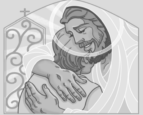
Your reward will be great in heaven